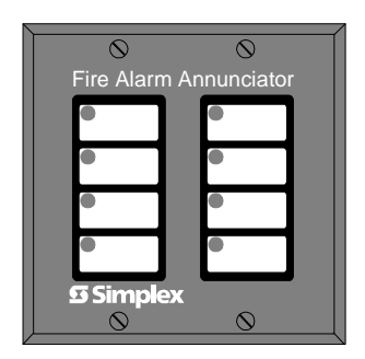
Dual-Gang Plate Assembly