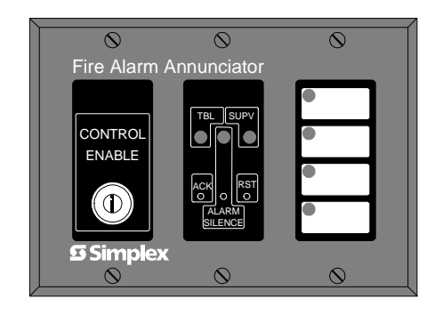
Three-Gang Plate Assembly