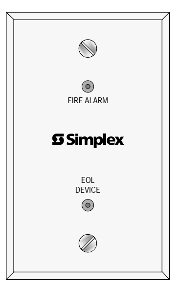
End-of-Line Relay Cover Plate