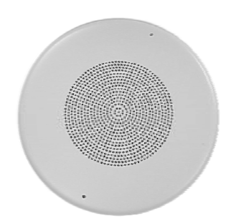
Round 2902 Series Speaker (12-3/4" diameter grill shown)

* Refer to Product Selection and Sound Output Ratings for additional details. Products are ULC listed under SimplexGrinnell, div of Tyco International of Canada LTD.