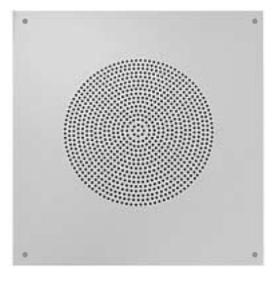
Square 2902 Series Speaker (12-1/2" grill shown)