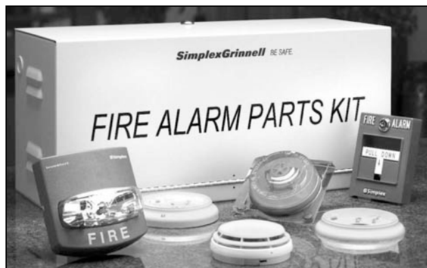
BESAFE Spare Parts Kit Cabinet and Parts

Parts Replacement. Ensuring a properly functioning fire alarm system often requires peripherals to be replaced. This can be due to damage (either intentional or unintentional), accumulation of dirt, excessive moisture, or other environmental conditions, or they may simply no longer work as intended. Whether replaced by on-site personnel, or by a Simplex product representative, having the correct replacement part on-site saves time and expense.