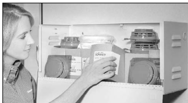
BESAFE Spare Parts Kit with Door Open